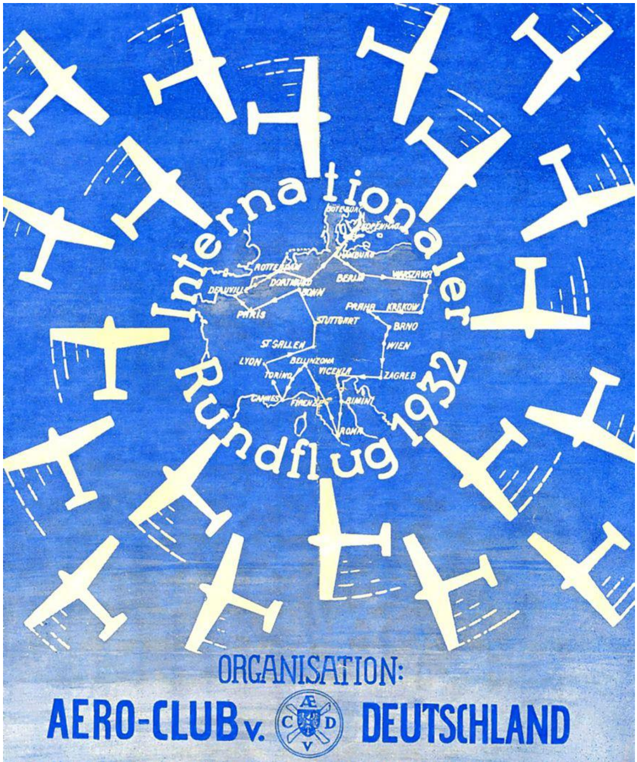
Cover of the Challenge International 1932 programme brochure